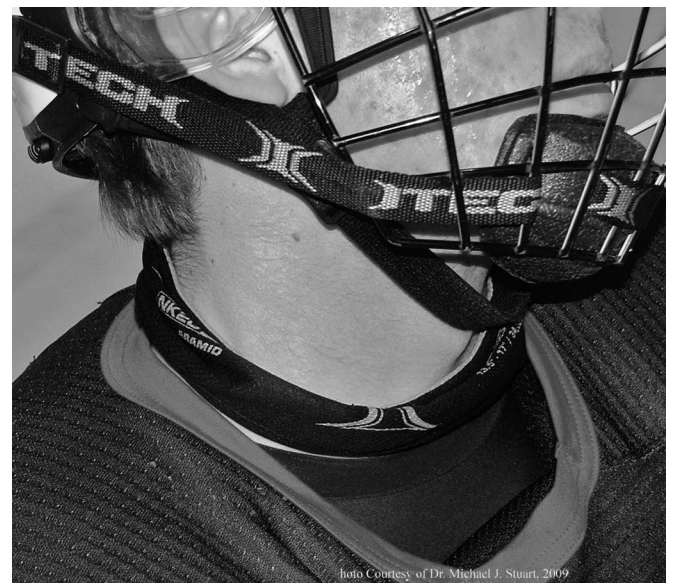
FIGURE 3. A photograph of a player wearing a “neck laceration protector” as mandated by the International Ice Hockey Federation (IIHF) for players younger than 18 years who compete in international competition.

Based on this survey, neck lacerations from a skate blade occur very infrequently and are usually not severe. The