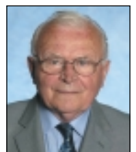
Karel Gut, 75

Gut is one of the most accomplished hockey personalities in the world. As a player, he represented his Czechoslovakia on 114 occasions, taking part in nine IIHF World Championships and three Olympics. As a coach Gut led Czechoslovakia to two world championship gold medals (1976 and 1977) as well as four silver medals. Gut also coached the national team on the 1976 (silver) and the 1980 (silver) Olympics.