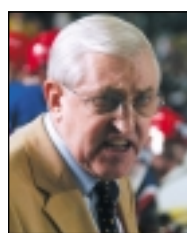
Boris is back