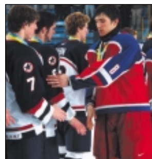
ACCEPTS DEFEAT: Despite ripping the U18 World Championship apart with his scoring, Ovechkin (left) had to congratulate Team USA to the gold medal.

"Owen Nolan", says Ovechkin and indicates that he doesn't mind a little ruggedness to come along with all the skill. He also says that Nolan's San José Sharks are his favourite NHL team, but he emphasizes that he has no thoughts at all of the 2004 NHL draft and that all his focus right now is on "thinking how to play better, how to be more useful to my club Dynamo Moscow."