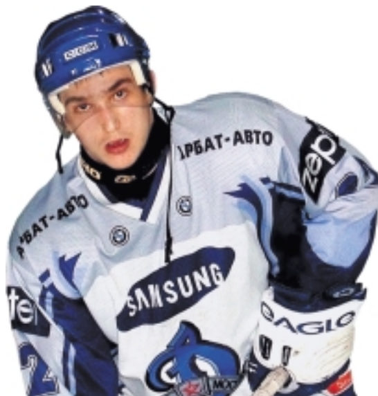
ALEXANDER THE GREAT?: That's what the experts say about this 17-year old new Wonderkid of Russian hockey.