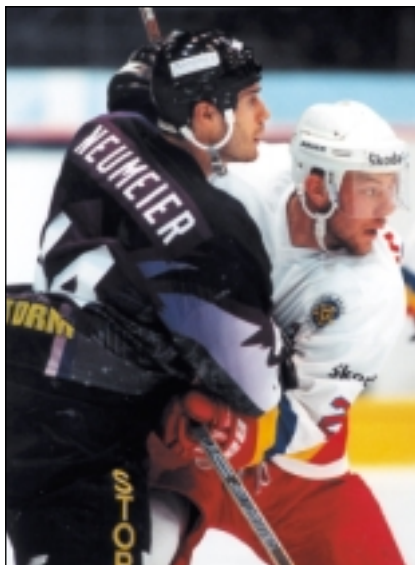
EURO DANCE: The EHL, here represented by Manchester Storm and Sparta Prague, should be a 8 team circuit according to René Fasel.