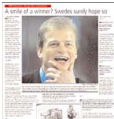
Ice Times in May 2005