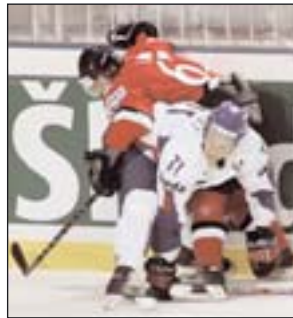
NO MORE TIED UP: Scores like Switzerland-Slovakia 2-2 in Riga will be a thing of the past. All future IIHF games will have a winner.

points. In case of a tie, teams will be awarded one point each and the game will be followed by a five-minute overtime period (teams skate 4-on-4) and a penalty shoot-out, if the score is still tied after overtime. The team that wins in overtime or the shoot-out is awarded an additional point.