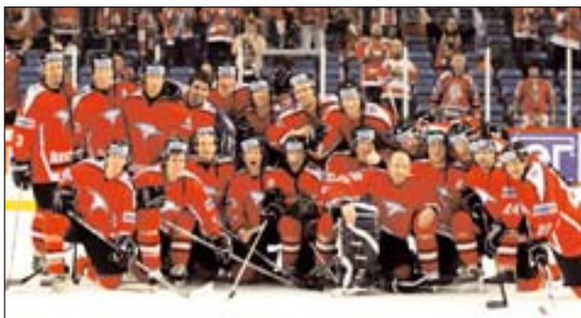
RUSSIA OR BUST: The Austrians will get to rejoin the World Championship party in Russia next season after taking top honors in Tallinn, Estonia.

tend with and a plucky Hungarian squad. Germany started the tournament in grand fashion, out-scoring its first three opponents 23-2. But the games, against Japan, Israel and Great Britain were merely warm-ups for the two key promotion-related games. In the first test, Germany came out tight against Hungary and paid, trailing 2-1 past the midway point of the game. But a four-goal rally in the third period saved the day for Germany,