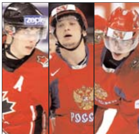
THE BIG THREE: From left to right the next generation of hockey stars; Canada's Sidney Crosby and Russia's Alexander Ovechkin and Evgeny Malkin

■ A few days into the World Championship, Canada added veteran Brendan Shanahan to its roster in Riga. The star forward arrived to a flurry of media all with the same line of questioning: 'Tell us about Sidney'.