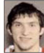
F: Ovechkin, RUS