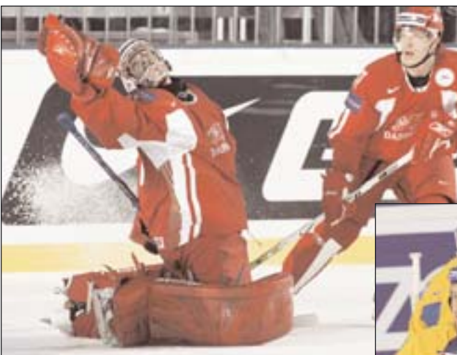
STRONG LINE-UP: Sweden and the Ukraine were perfectly coordinated, at least in this photo, where the blue and yellow clad players provide perfect symmetry while waiting for the puck.