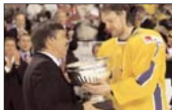
TRIPLE: After being named to the All Star team and Best Defenseman by the directorate, Kronwall also received the MVP trophy from the hands of IIHF President René Fasel.

Salming played 17 seasons in the NHL and was the man who in 1973 broke down the barriers for all the Europeans who followed.