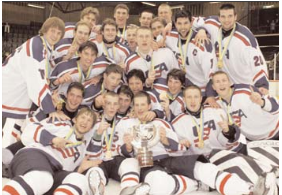
TWICE IS NICE: The American U18 team is getting good at striking the championship pose around the U18 trophy. It was the second straight year the team has won the gold medal.

The fact that the team worked so well together as a unit,